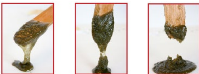
Example of thickening with Z.FIX FIBRA NATURALE

In general, with regard to multi-layer applications of Z.FIX CLEAR N , please note the following: